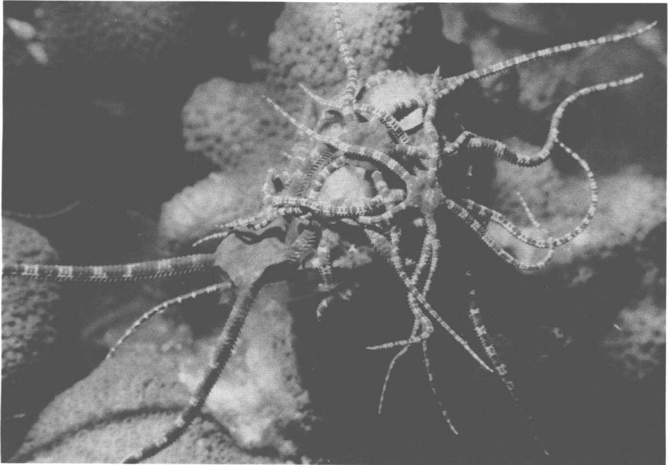
Figure 2. Ophiomyxa flaccida spawning.