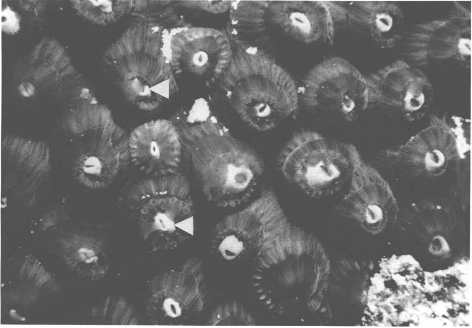
Figure 1. Montastrea cavernosa sperm releasing bladder.